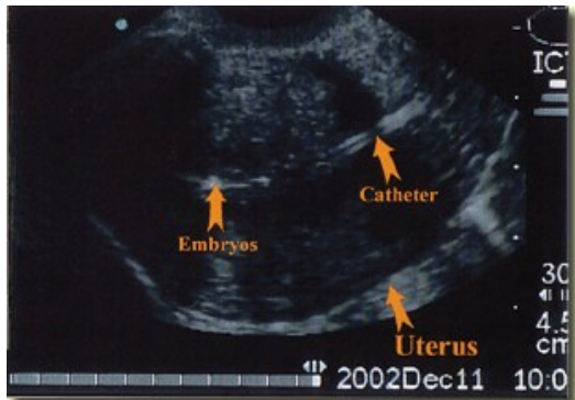
Fig. a - Embryos, Catheter, Uterus

At West Coast Fertility Centers, our scientists and staff are constantly searching for a way to increase our success rate. Embryo transfer and implantation process have become an integral part of improving the success rate of infertility treatment. Ultrasound guided transfer (Fig.a) is an important way to verify that embryos are being placed at correct location and that this location is indeed essential for establishing implantation.